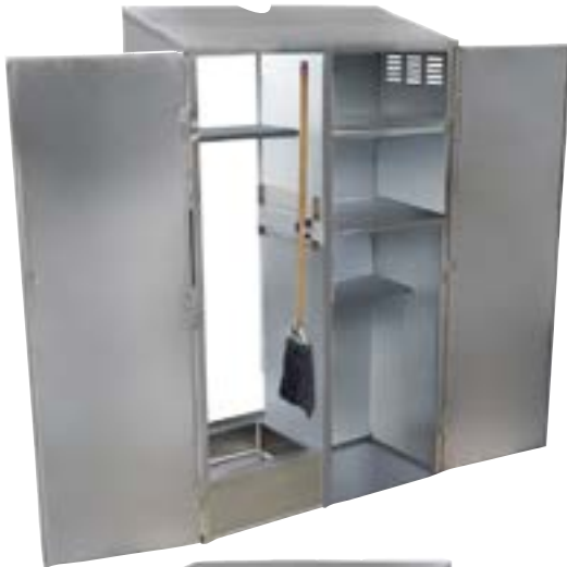
48231 Left Mop Sink