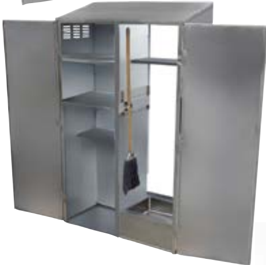
48232 Right Mop Sink