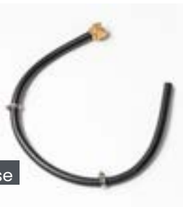
Service Faucet Hose