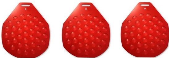
Includes 3 Molding Plates