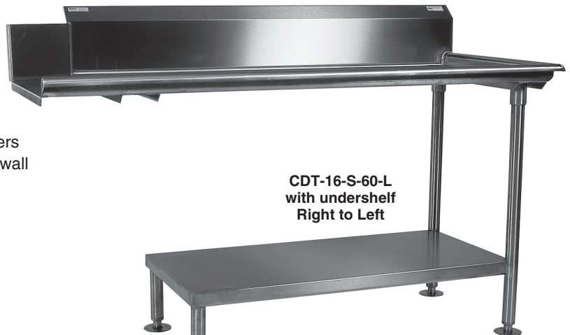
CDT-16-S-60-L with undershelf Right to Left