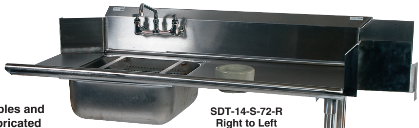
SDT-14-S-72-R Right to Left

14 Gauge, 304 series stainless steel dish tables and legs with stainless steel clad bullet feet. Fabricated bowls are 14" deep water level.