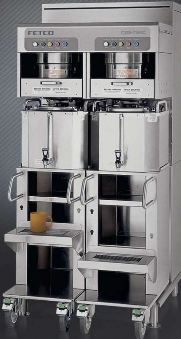
Shown with 6.0 Gallon Mobile LUXUS® Thermal Dispenser (LBD-6C) and Serving Station for LBD-6 with Drip Tray

FETCO® is the category expert and the ONLY manufacturer of ultra high-volume (7-24 Gallon) portable coffee brewing systems for very large scale operations. Due to the high capacity output and reliable performance the CBS-7000 Series is the preferred choice for specification in hotels, stadiums, convention centers and other large venues.