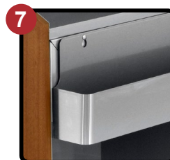
Removable Bottle Speed Rail

Scan QR code for BBC bars without handsinks.