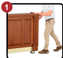
Made for Mobile Applications