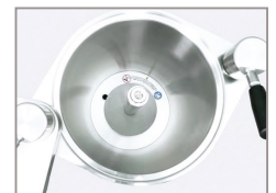
Fully stainless steel barrel bottom with water draining outlet. Simple cleaning.