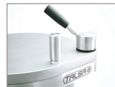
Removable lid, adjustable lid lock nuts with handles