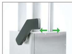
Knee lever with reversible operating direction