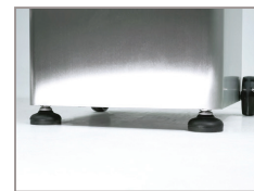
Adjustable anti-vibration feet