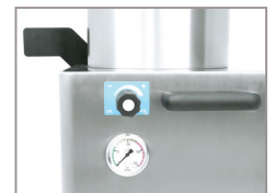
Speed control and pressure gauge