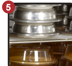
Heavy-Duty "No Sag" Shelves