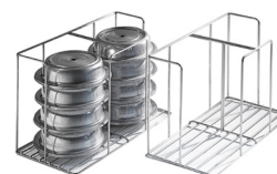
CP carries Covered Plates