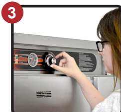
Eye-Level Control Panel