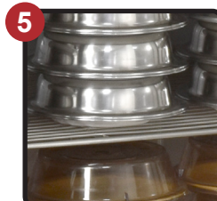
Heavy-Duty "No Sag" Shelves