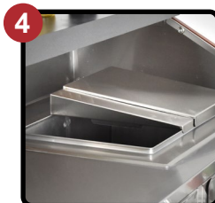
50lb Ice Bin with Drain