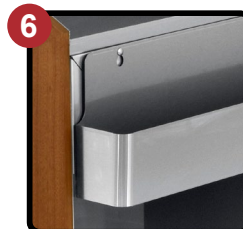
Removable Bottle Speed Rail