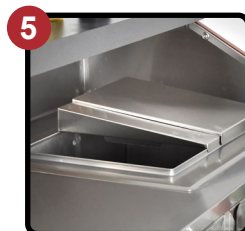
60lb Ice Bin with Drain