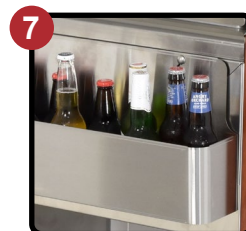
Removable Bottle Speed Rail

Scan QR code for CB bars without handsinks.