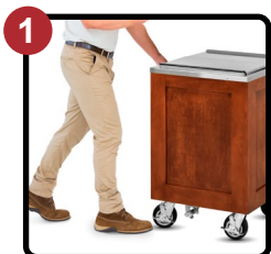
Made for Mobile Applications