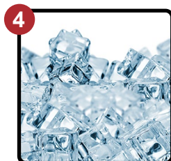
200lb Insulated Ice Storage