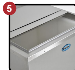
Stainless Steel Sliding Cover