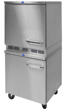
9404-27DT-RTFBL Model Shown