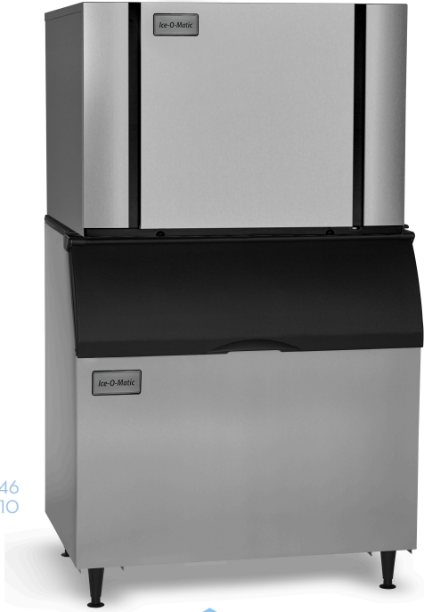
CIM1446 ON B110