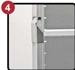
Gravity Door Latch