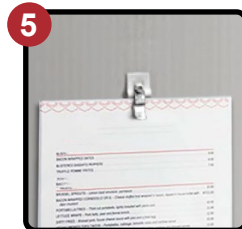
Menu Card Holder