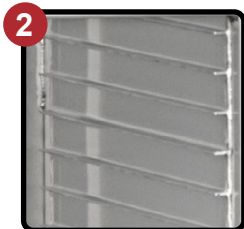
Fixed Tray Slides