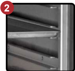
Unique Pan Slides