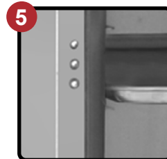
Field Reversible Door