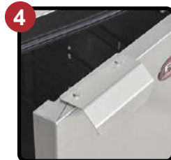
Magnetic Work Flow Handles