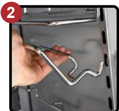
Adjustable Tray Slides