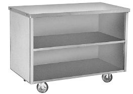
Model RAN ST-4S shown