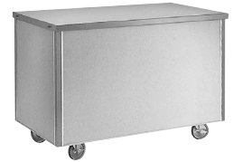
Model RAN ST-4 shown