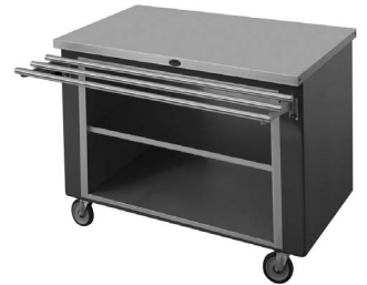
Model RANFG ST-4S shown with RAN TUB48 trayslide

SHORT FORM SPEC: Mobile, work top serving station. 16 gauge stainless steel top w/ locking device. One-piece fiberglass body, provided with 4 swivel casters (2 locking).