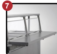
Optional Sneeze Guard & Tray Slide Shelf