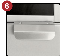
Work Flow Handle