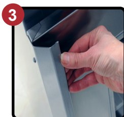
Magnetic Work Flow Door Handle