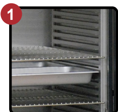
Versatile Fixed Rack