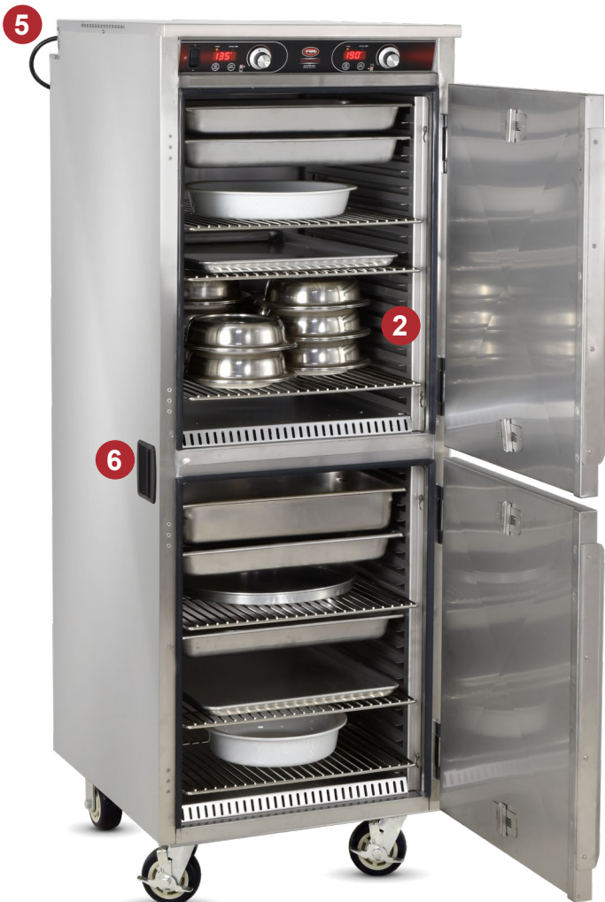
HLC-2127-9-9 Quick Ship Item