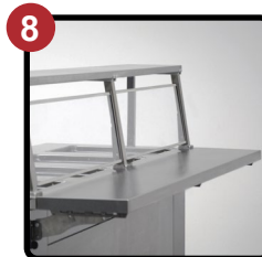
Optional Sneeze Guard & Tray Slide Shelf