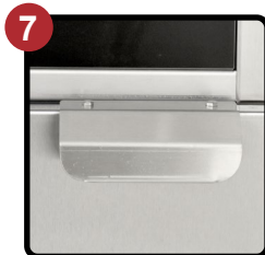
Work Flow Handle