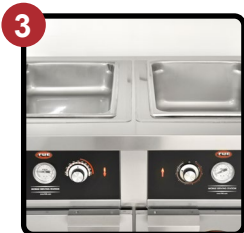
Separately Controlled Wells

(Shown With Optional Accessories Sneeze Guard, Tray Slide Shelf, and Full Perimeter Bumper)