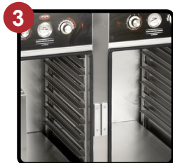
Separately Controlled Compartments