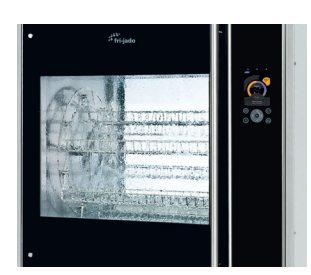
Even accessories are cleaned