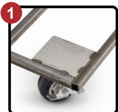
Tubular Welded Base Frame