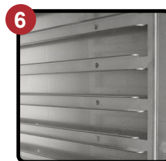
Fixed Rack Assembly