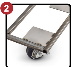
Built For Transport