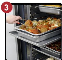
Adjustable No-Tip Tray Slides