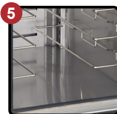
Open Bottom Base