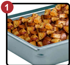
Bulk Food Reheating