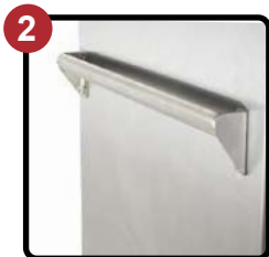
Rear Tubular Push Handle

Improve your operation today! See Specification page 07-02, RH-B series, for high volume basket rethermalization ovens from FWE.