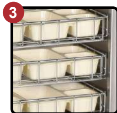
18" x 26" Baskets