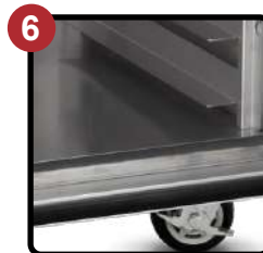
Open Bottom Base