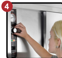
Eye-Level Control Panel