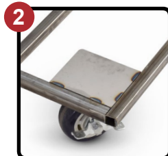
Tubular Welded Base Frame