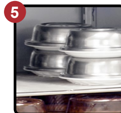
Heavy Duty "No Sag" Shelves