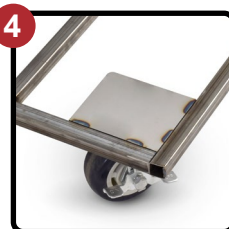
Built for Transport