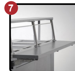
Optional Sneeze Guard & Tray Shelf