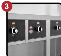
Independently Controlled Wells