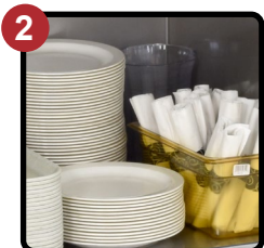
Open Base for Storage