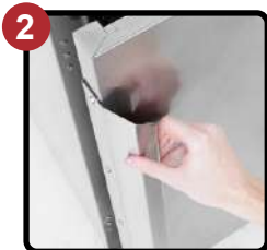
2 Magnetic Workflow Door Handle