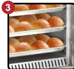
3 Keeps Food Hot and Fresh