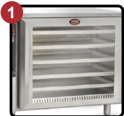
1 See-Thru Lexan Door (standard on countertop models)