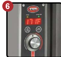
6 Electronic Controls