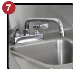
8" Deck Mount Nozzle