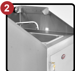
All Stainless Steel Construction