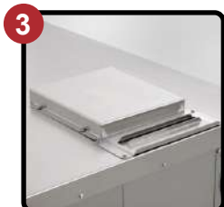
Programmable Venting Baffle