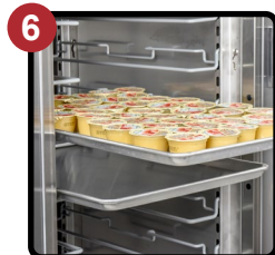
No Tilt Tray & Shelf Slides