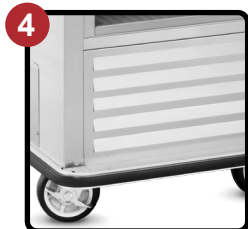
Bottom Mounted Compressor