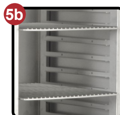
GN Fixed Rack