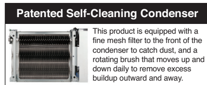
Patented Self-Cleaning Condenser

This product is equipped with a fine mesh filter to the front of the condenser to catch dust, and a rotating brush that moves up and down daily to remove excess buildup outward and away.