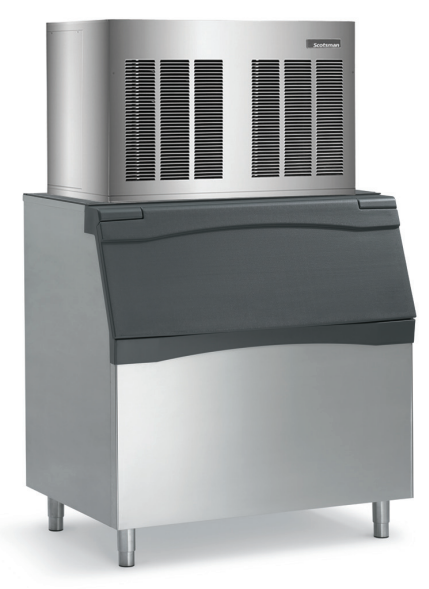
Shown on B948S bin with optional KLP8S legs..