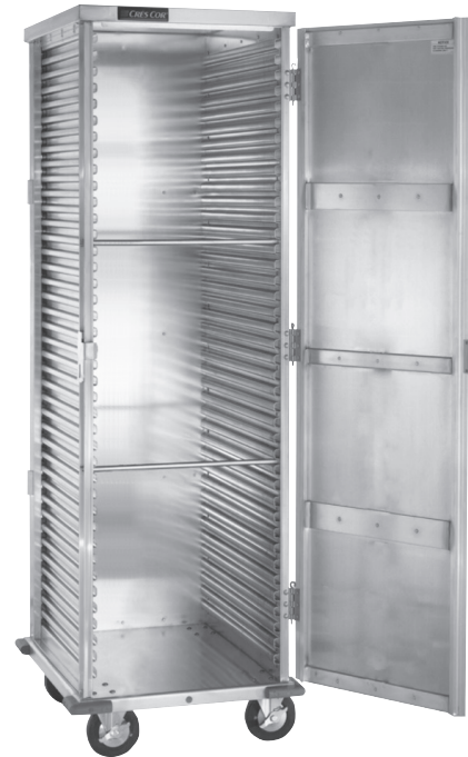
100-1841-DSD (Shown with optional corner bumpers)