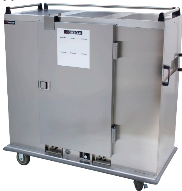
EB-150A (Shown with accessory options)