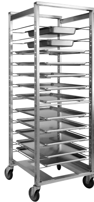
207-UA-13A (Pans not included)