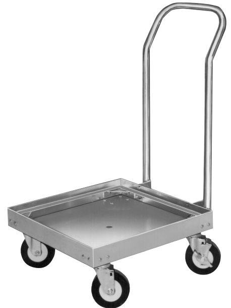
500-2020 (Shown with accessory handle)