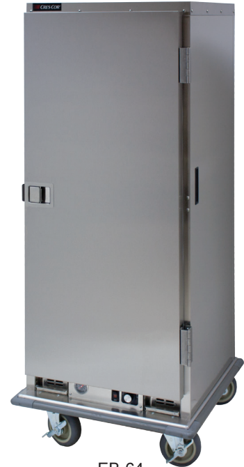
EB-64 (Shown with accessory options)