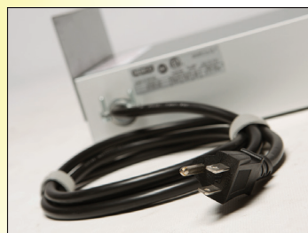
Optional cord-and-plug units simplify installation.