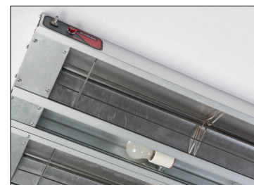
Optional showcase lighting adds visual appeal.