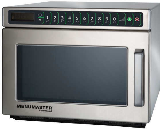
Model MDC12A2 shown