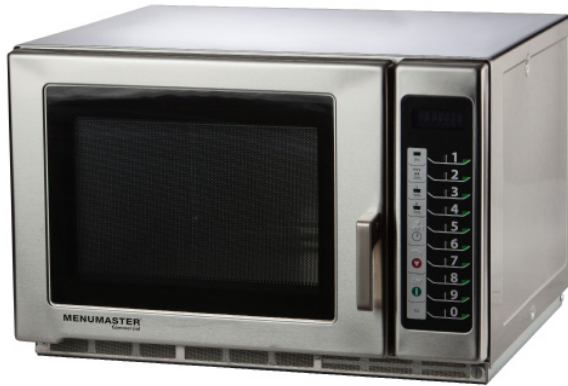
Model MFS18TS shown