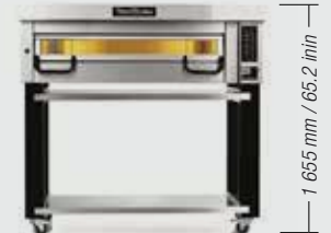
PM 911 / 921 / 931 / 941