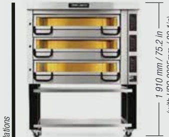
PM 913 / 923 / 933 / 943