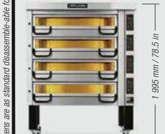
PM 914 / 924 / 934 / 944