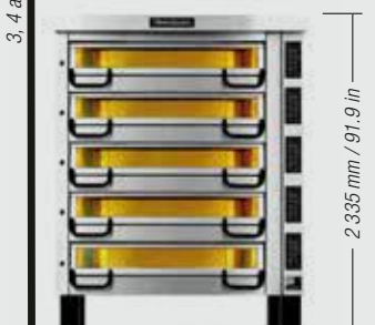
PM 915 / 925 / 935 / 945