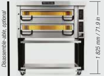
PM 912 / 922 / 932 / 942