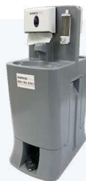
Model #69961 30-gallon