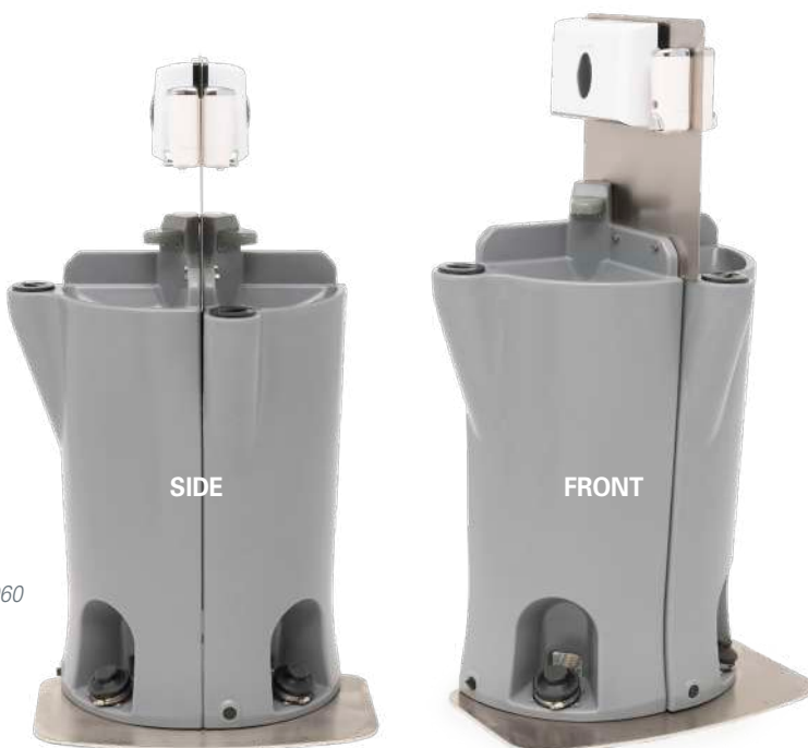
Model #69960 12-gallon