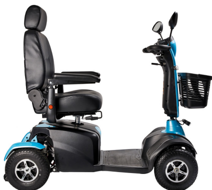
Photo 2 Upright tiller position