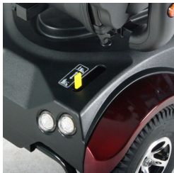
Photo 12 Drive position

The Excel Roadster DX8 Deluxe has two settings, namely the drive setting and freewheel setting (see photos 12 and 13). The scooter should always be in drive when you want to use it. The freewheel setting allows you to move the scooter without turning it on. When the scooter is put in freewheel mode, it can be pushed without the motor giving resistance.