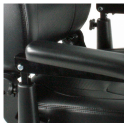
Photo 6 Height adjustment star knobs

Not only can the armrests of the Excel Roadster DX8 Deluxe be flipped up, they can also be adjusted in height. To adjust the height of the armrests, unscrew the star knob on the back of each armrest (see photo 6) until the arms have loosened. Then pull or push each arm up or down to adjust the armrest height. When the desired armrest height has been achieved, re-screw the star knobs until the armrests are fixed in position.