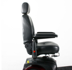
Photo 9 Side seat position