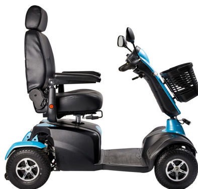
Photo 3 Angled tiller position