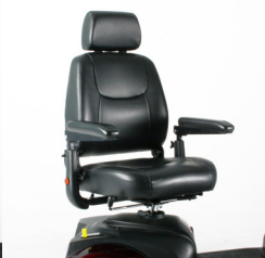
Photo 10 Angled seat position