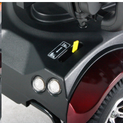
Photo 13 Freewheel position