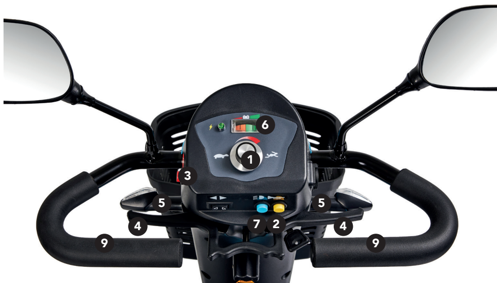
Photo 1 Dashboard display

The Excel Roadster DX8 Deluxe is equipped with a clear dashboard. The dashboard consists of different components that all have a different function. Below, several components are explained further: