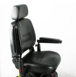
Photo 5 Up armrest