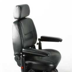
Photo 4 Down armrest

The Excel Roadster DX8 Deluxe is equipped with height and width adjustable flip-back removable armrests. To flip the armrests up, simply pull the armrests upwards. This makes getting on and off your scooter easier to do.