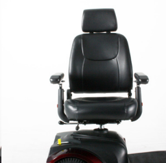
Photo 11 Rotated seat position