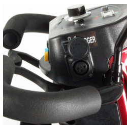
Photo 14 Charging port

The Excel Roadster DX8 Deluxe is equipped with two closed, maintenance free batteries. Van Os Medical recommends to charge the batteries fully before first use. We advise you to charge them for at least 12 continuous hours. The charger port is located on the tiller (see photo 14). The batteries of the Excel Roadster DX8 Deluxe can not be removed for the purpose of charging.