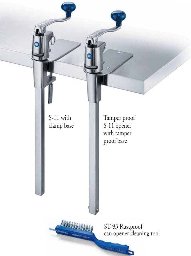
S-11 with clamp base