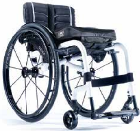
XENON² FF THE LIGHTEST