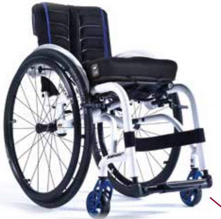
XENON² H (HYBRID) THE STRONGEST