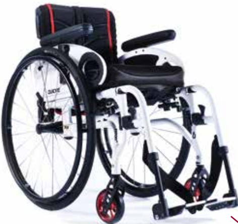
XENON² SA THE ALL ROUNDER