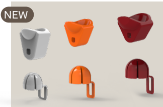
Juice extraction kits

A system developed by Zummo to assemble and disassemble the balls of the kit in just one movement.