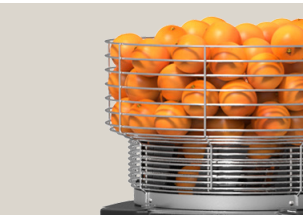
Basket in two sizes

The machine includes a 20 lbs capacity basket as standard equipment. In those cases when an increase in the juicer's autonomy is required, there is an optional basket with load capacity of up to 35 lbs of fruit.